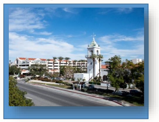
Leased in 1997; 385 beds Selected by DHCD to redirect and reposition struggling Desert Hospital